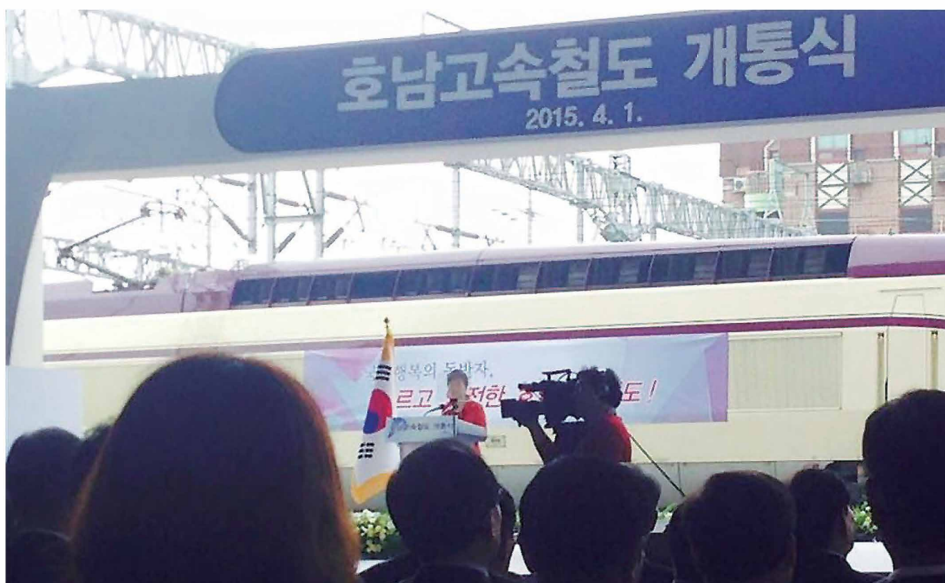
President Geun-Hye Park giving her speech during the opening ceremony of the new KTX Honam Line.