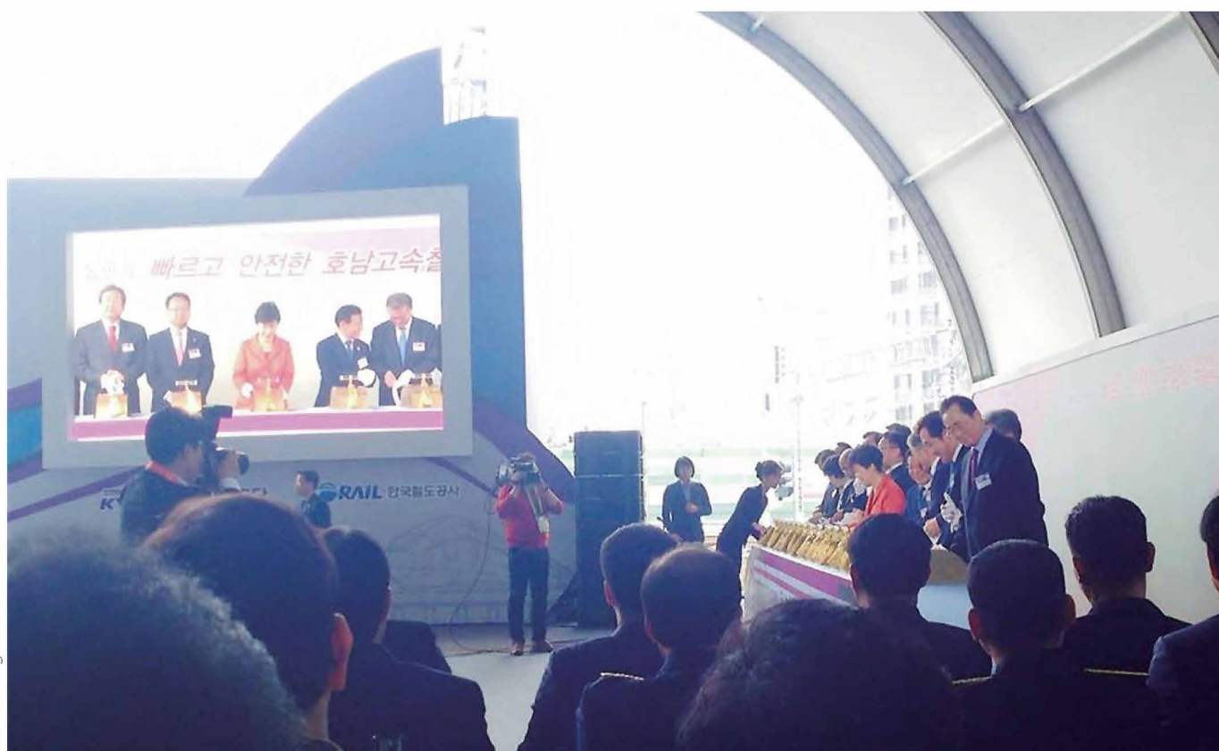
President Geun-Hye Park, together with the other government officials, inaugurating the new KTX line.